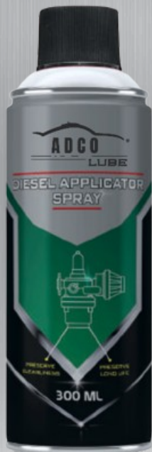
DIESEL APPLICATOR SPRAY

Extra performance cleaner for fuel systems of diesel engines. It is suitable for all types of diesel engines, converters. Quickly and effectively cleans fuel system parts, removing carbon, scale, tar and other deposits and valves. Effective moisture displacement, contaminant removal, and deposit prevention for the complete fuel system, from the tank to the combustion chamber improved engine performance and fuel consumption