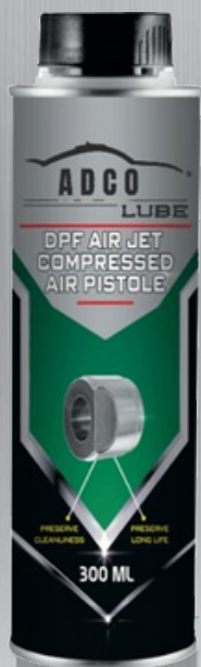
DPF AIR JET FLUID

Extra performance cleaner for fuel systems of diesel engines. It is suitable for all types of diesel engines, converters. Quickly and effectively cleans fuel system parts, removing carbon, scale, tar and other deposits and valves. Effective moisture displacement, contaminant removal, and deposit prevention for the complete fuel system, from the tank to the combustion chamber improved engine performance and fuel consumption