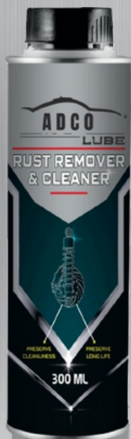
RUST REMOVER & CLEANER PLUS

Rust remover and lubricant Provides a high-grade lubricating agent based on a mixture of oils and penetrants in a blend of solvents. It provides protection from rust and corrosion on metal objects. It has been formulated to offer quick and easy removal of seized and rusted components. Cleanly lubricates Stops squeaks and protects against rust invasion. Frees sticky joints.