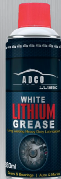
WHITE LITHIUM SPRAY