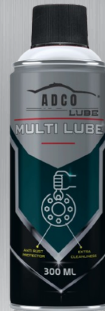
MULTI LUBE (ENGINE DEGREASER FOAM SPRAY)