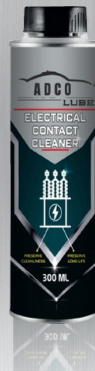
ELECTRICAL CONTACT CLEANER