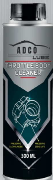
THROTTLE BODY CLEANER