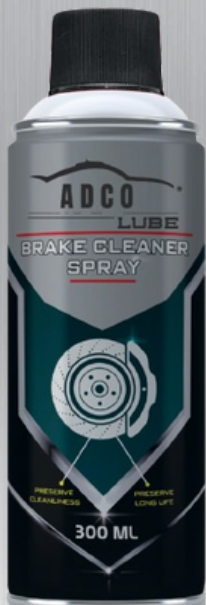
BRAKE CLEANER SPRAY

Universal cleaner for automotive industry which cleans, degreases, and evaporates without leaving residues. It is used primarily for cleaning surfaces in vehicles and everyday life intended for subsequent processing (gluing, painting, coating, sealants, etc.) Brake Cleaner can be used on brakes (drum and disc brakes, brake pads, brake blocks, cylinders, springs, and bushings), clutches (clutch linings and components) and on engine parts-extends their service life with regular use.